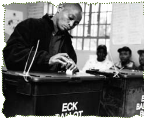
It was the casting of votes that triggered off spontaneous and other well-planned violence.

In response to these challenges UNDP Kenya has dedicated a fully-fledged Unit to support the Government and People of Kenya in their pursuit for peace to facilitate development through mitigating causes and negative impacts of violent conflicts and small arms and light weapons. Crisis prevention and recovery, which forms the impetus for the interventions is one of the key focus areas of UNDP. In the support of crisis prevention and recovery initiatives UNDP provides experience in the areas of peace building, conflict and development working with Government, non-state actors, and communities; a multi-sectoral